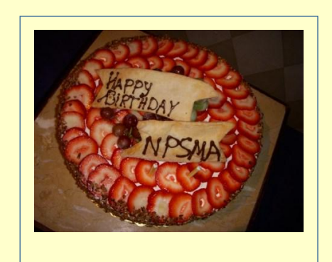
The NPSMA Celebrated its 2<sup>nd</sup> Birthday at the Nashville Workshop

NATIONAL PROFESSIONAL SCIENCE MASTER'S ASSOCIATION 100 INSTITUTE ROAD, WORCESTER, MA 01609 (508) 831-4996 * WWW.NPSMA.ORG