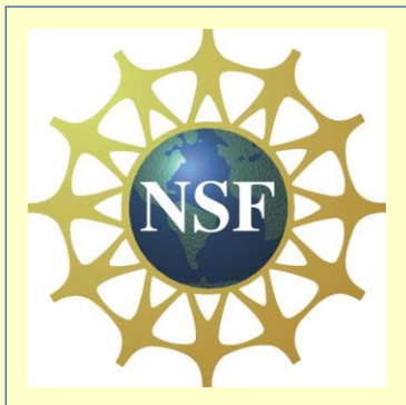
The National Science Foundation released its Science Master's Program grant solicitation on August 19